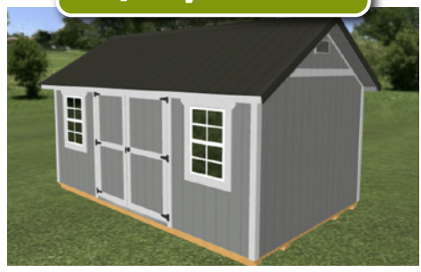
Artist rendering - Details will vary